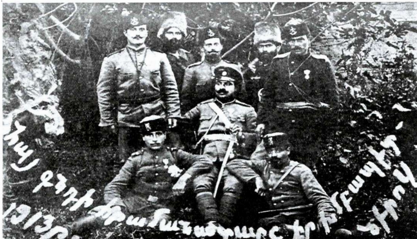
Garegin Nzhdeh (centre) with commanders of the Armenian volunteer Battalion, First Balkan War, Sofia, Bulgaria (1913)