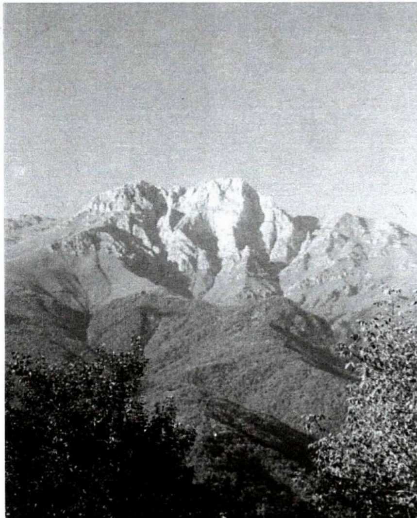
Mount Khustup, Zangezur (Siunik), Armenia