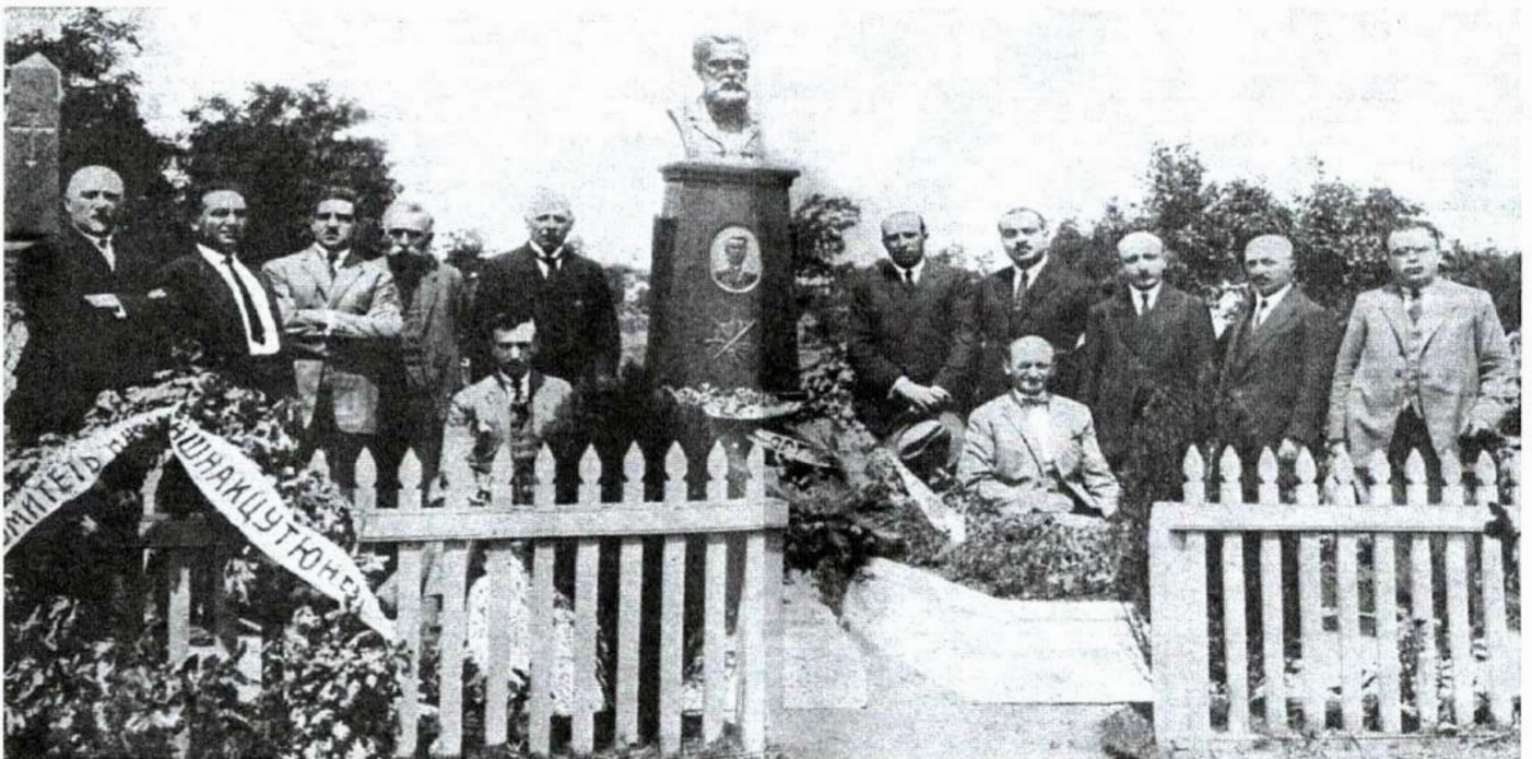
Nzhdeh at the tomb of Kristapor Mikaelian, one of the founders of The Armenian Revolutionary Federation (Dashnaktsutian)