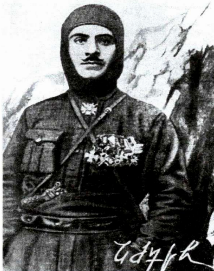
Nzhdeh in Zangezur (Siunik), 1920