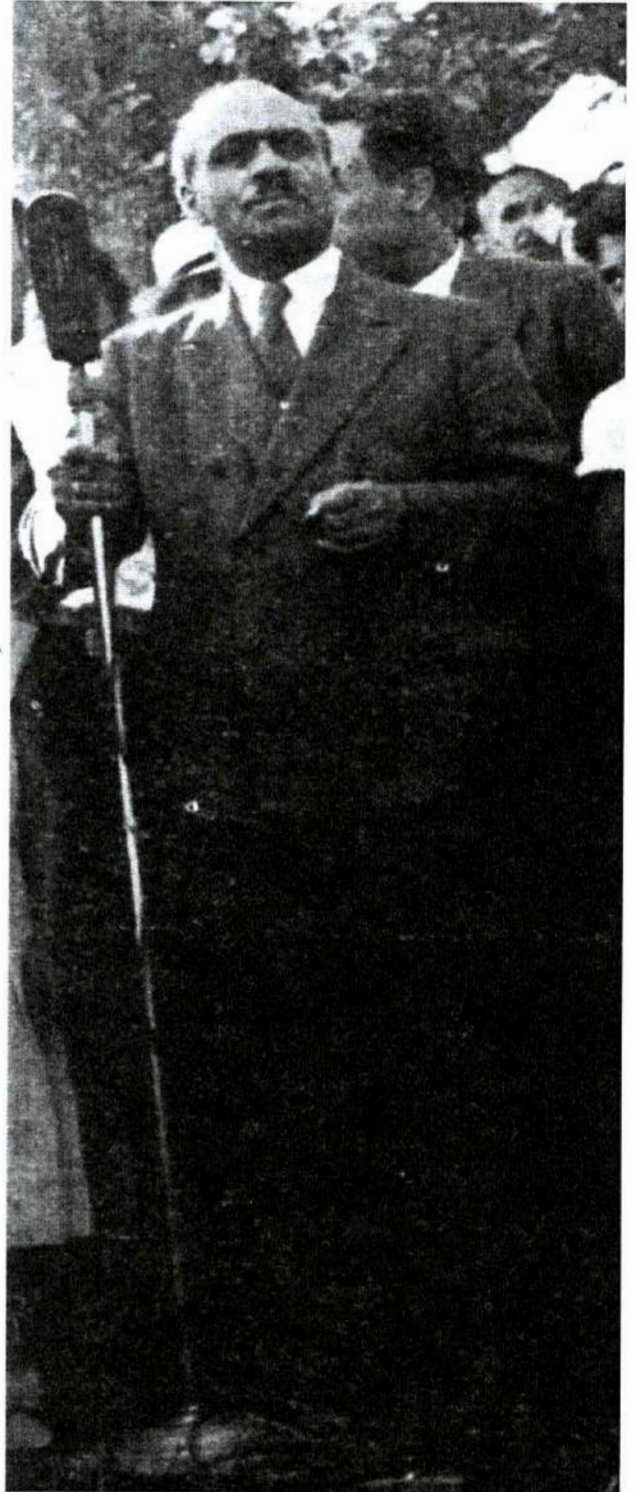
Nzhdeh during speech, USA