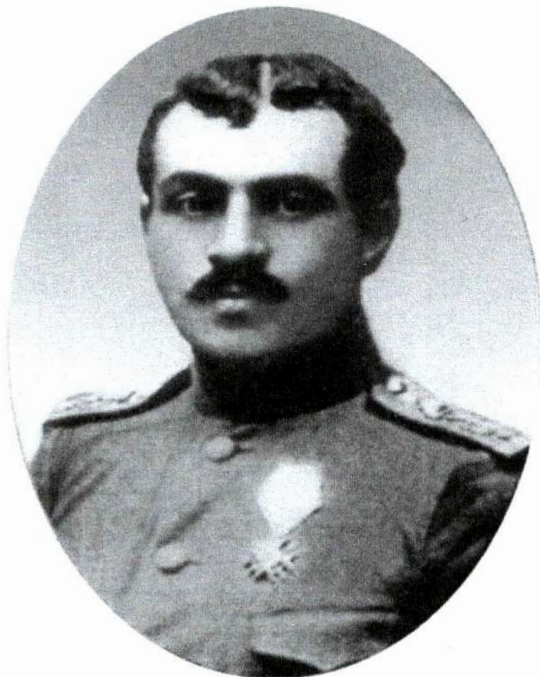
Nzhdeh in the Bulgarian army officer uniform