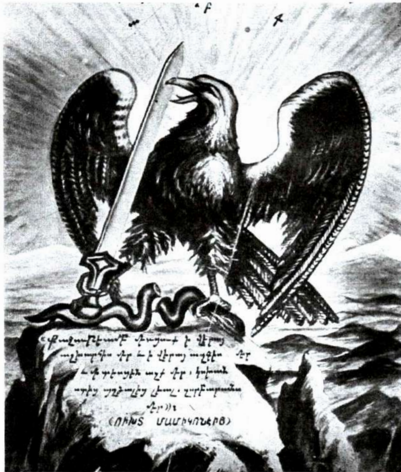
The coat of arms of Taronakan movement