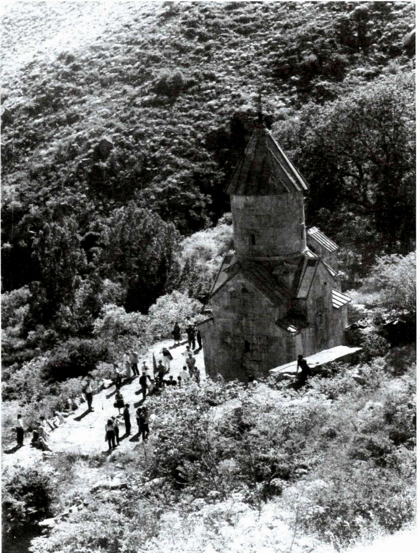
The churchyard of Spitakavor, Vayots Dzor, Armenia, where Nzhdeh's ashes are buried