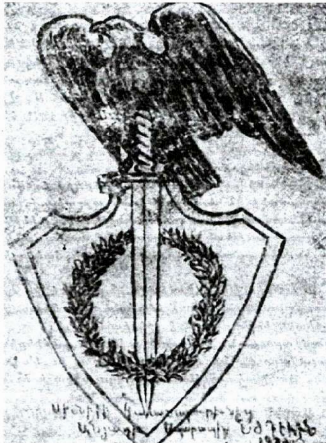
Coat of arms of the Republic of Mountainous Armenia, Zangezur (1921)