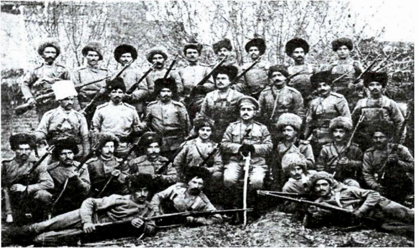
The Armenian volunteer detachment under the command of Nzhdeh (1915)